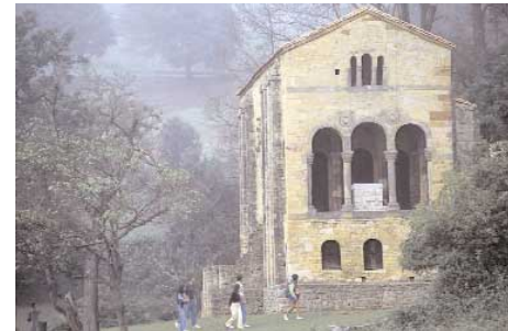
Nuestra Señora del Naranco

The three Basque provinces in French territory belong to the Atlantic Pyrenees department. They are: Lapurdi (capital, Baiona),