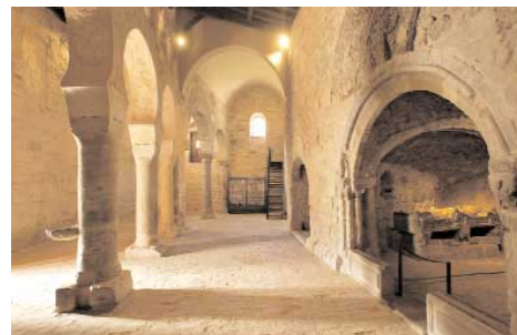
Suso monastery, The Rioja

motorway, exiting in Marcilla, then taking the N-121, and later the NA-124 to Carcastillo. Here we find one of the best examples of cistercian architecture: the monastery of La Oliva.